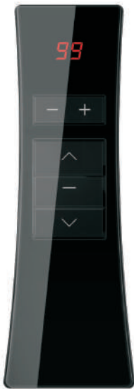
A6 button transmitter