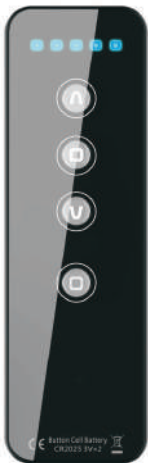
A3 button transmitter

A6 and A3 button transmitter use 868MHz radio frequency (industry innovation) with a strong anti-jamming capability, high transmit sensitivity, and long distance transmit etc function. Surface imported acrylic panel, smooth operation, intimate feel processes.